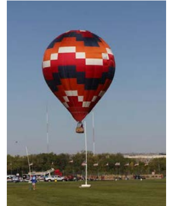
Photo Adventures from The National Balloon Classic