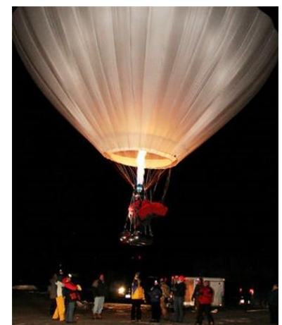
Launching the double-walled balloon for record setting duration flight.