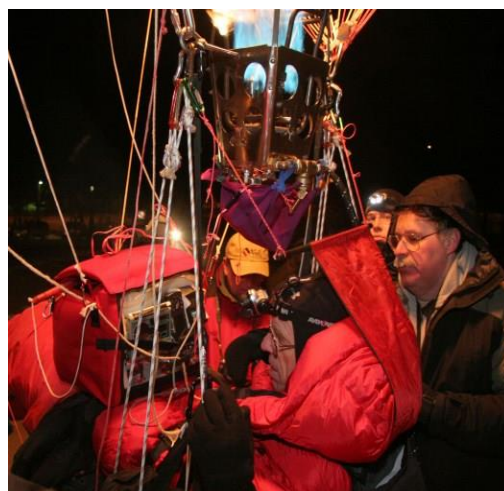
Preparing with crew for record setting duration flight